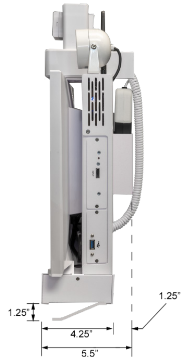
Left Side View of System Detailing: